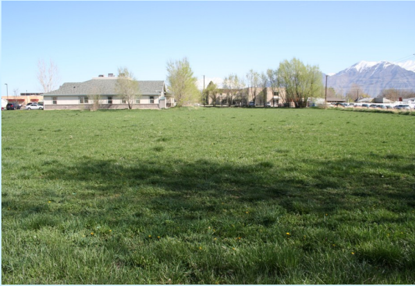
Early on—Around July 1, 2010