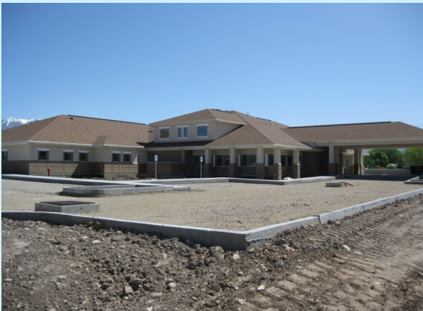
About April 15, 2010