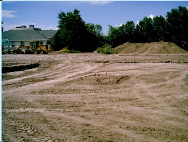
Approximately August 15, 2010